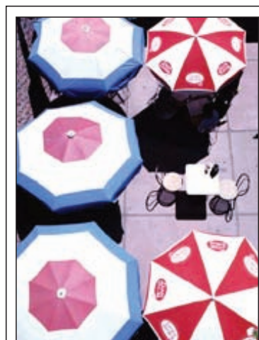
Placemaking: Community results from collective spaces that invite shared participation

The LUCE project is entering a new public outreach phase that will seek to develop and build community support for guiding principles. These principles will emerge from several neighborhood- and community-focused workshops and meetings. A series of workshops will begin in March on Placemaking followed by a community-wide symposium on Economics and Affordability. Before summer, a workshop will be held that focuses on the City's Industrial lands to develop principles on a future vision for this specific part of the City. Following a short break, the outreach effort will resume with two